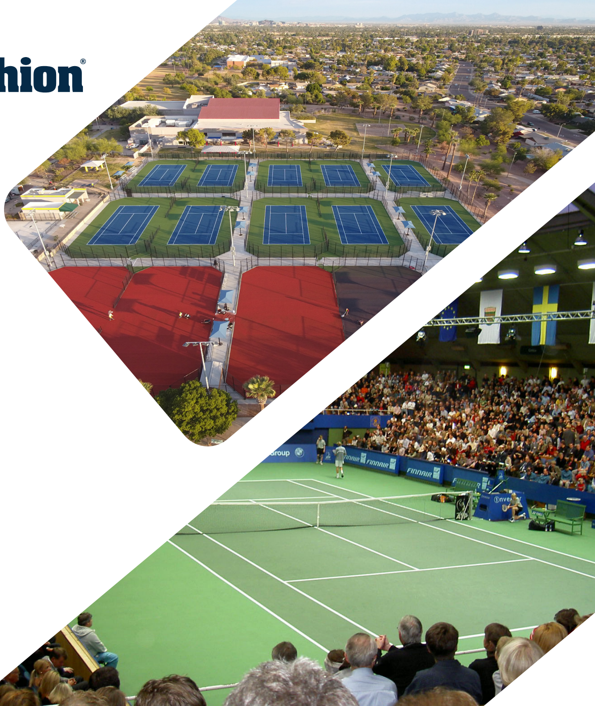
Top image: Kiwanis Park Tempe - Arizona Installed by: Elite Sports Surfacing

Plexicushion® Tournament , featuring 5 layers of acrylic cushion