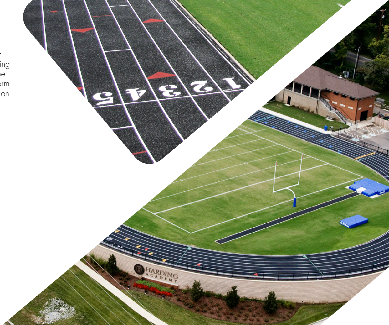
Bottom image: Harding Academy Nashville, Tennessee