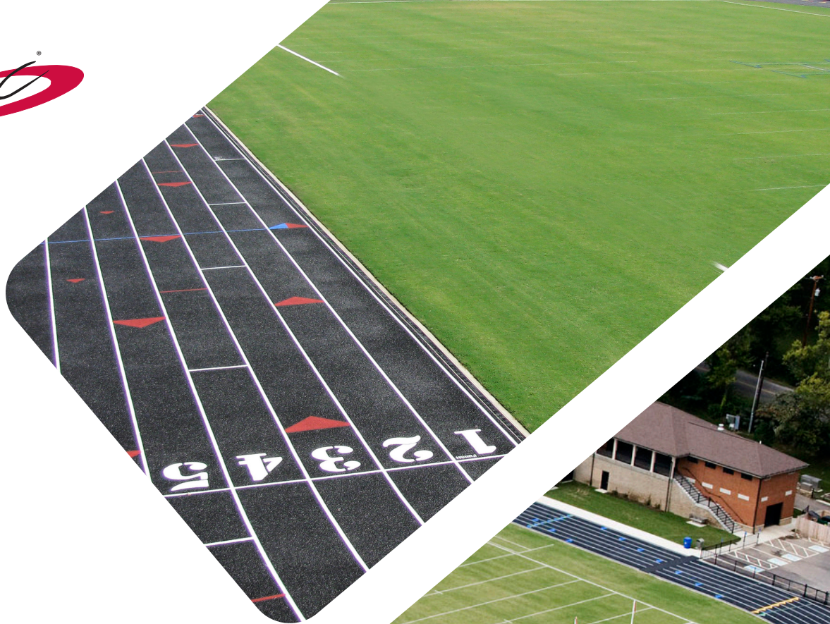
Top image: Harding Academy Nashville, Tennessee

Made from select black SBR rubber granules bound with a black pigmented Plexitrac® Binder, the track is top coated with a highly pigmented black finish coat using either Plexitrac® Coating or Surfacer. This provides the track with additional long-term UV light stability and abrasion resistance.