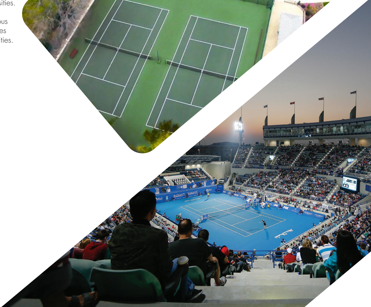
Bottom image: Mubdala Championships