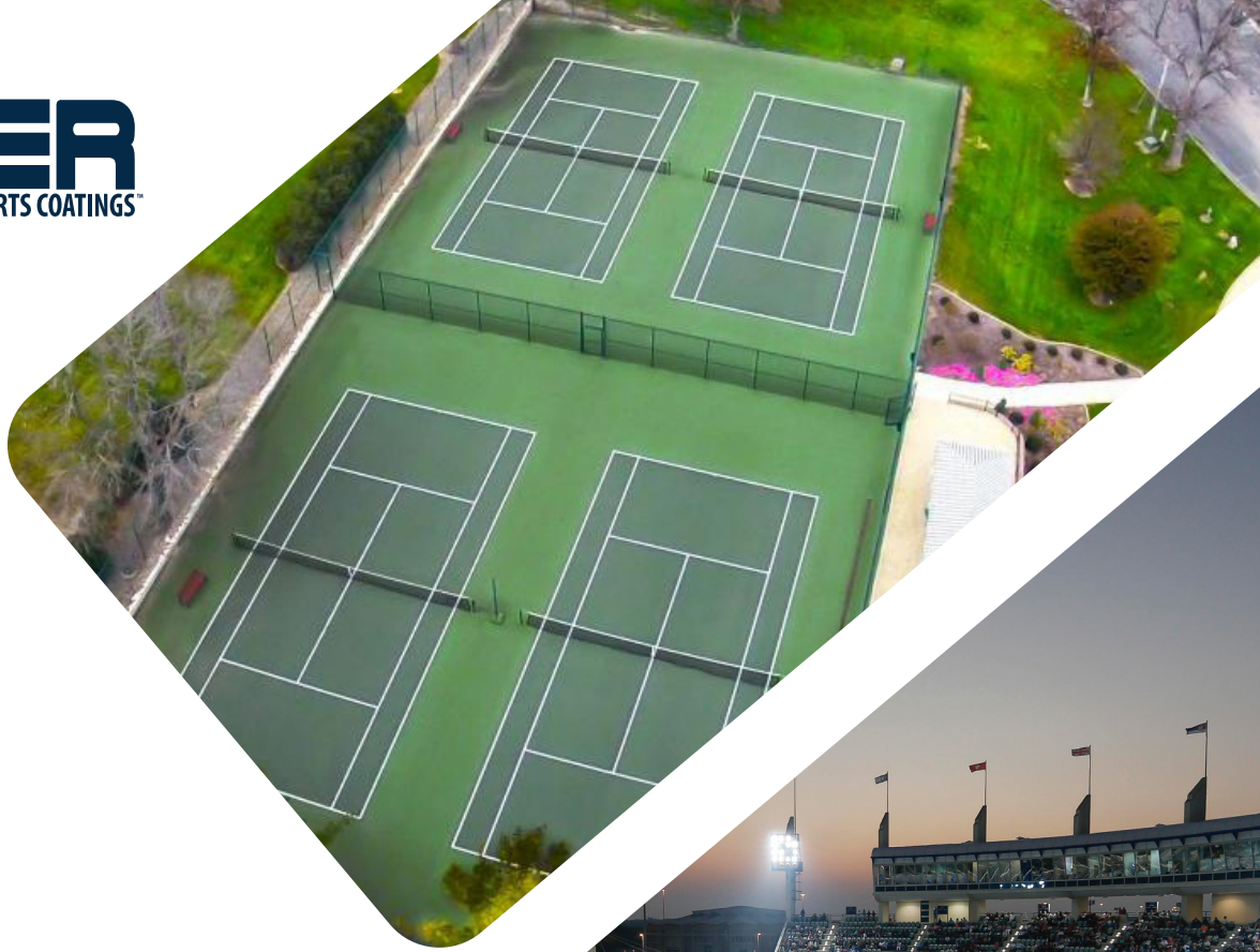
Top image: Public Park - Maryland Installed by: ATC Corp.

Premier Sports Coatings® provides world-class performance coatings for residential courts, clubs, colleges, and universities. However, they are also designed to meet the rigorous requirements of municipalities and other recreational facilities.