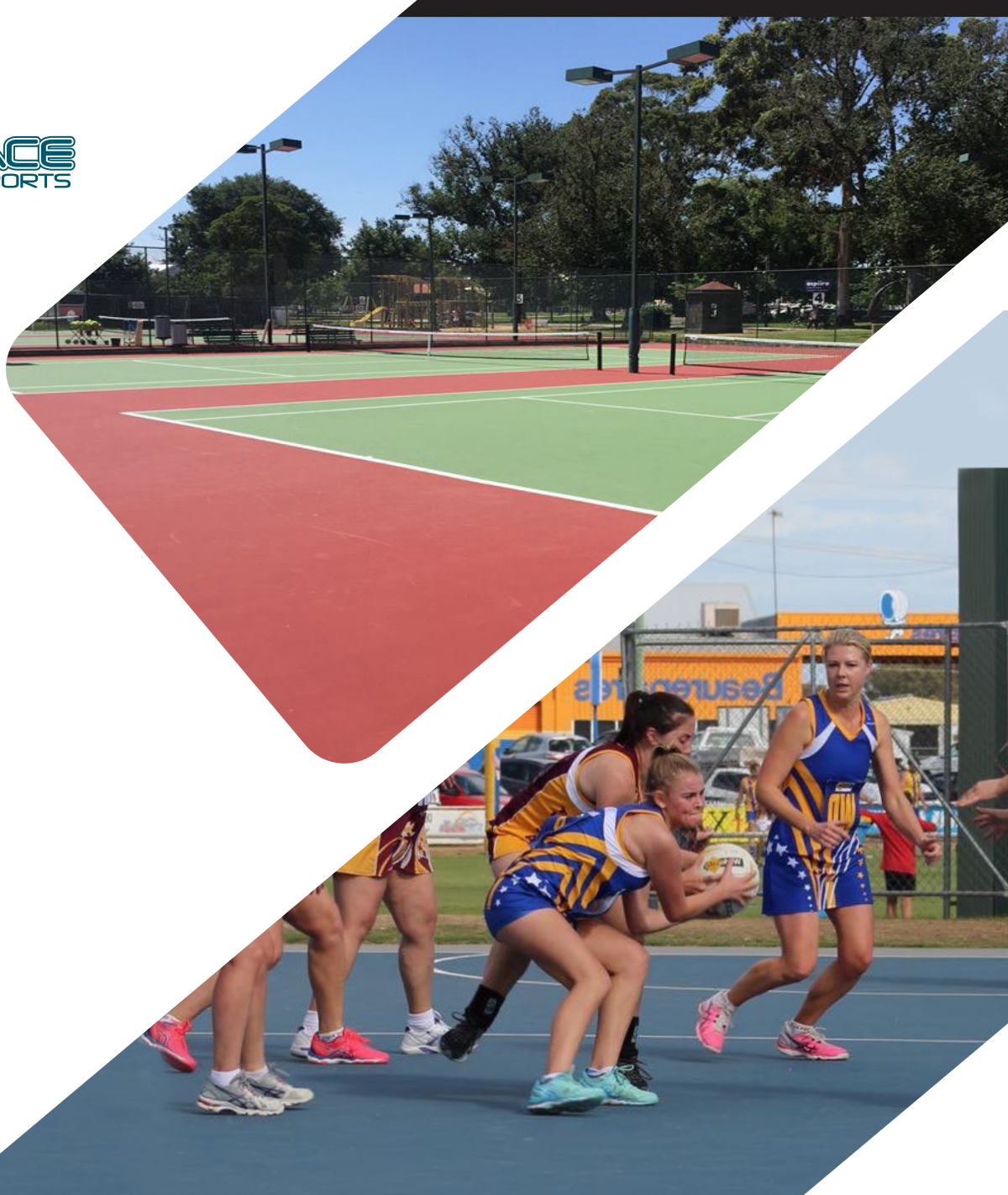
Top image: Resurfaced court in Williamstown, Australia Installed by: Matchpoint Systems

Rebound Ace® Air Cushion retains all the design, performance and playing properties of the proven, patented Rebound Ace® surfaces.